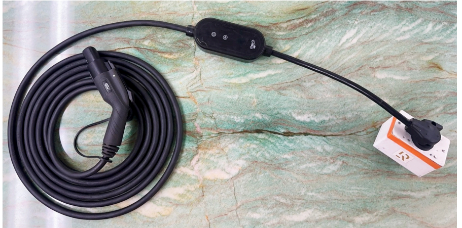
Direct charging for vehicles with SEA J1772 adapter