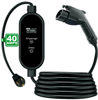
Charging unit fully assembled